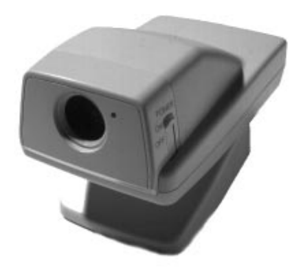
The QuickTime Conferencing Camera 100 provides highresolution, color images during your videoconferences.